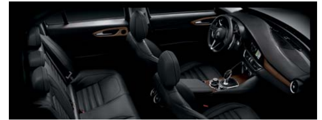
Black Dashboard with Walnut Detailing (also available with Oak Detailing) - Black Leather Uphostery