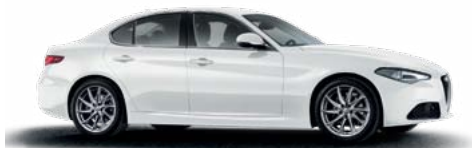
217 Alfa White Standard