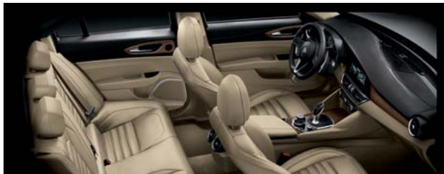
Beige Dashboard with Walnut Detailing - Beige Leather Upholstery