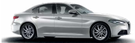
620 Silverstone Grey Option