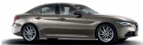
082 Imola Titanium Option