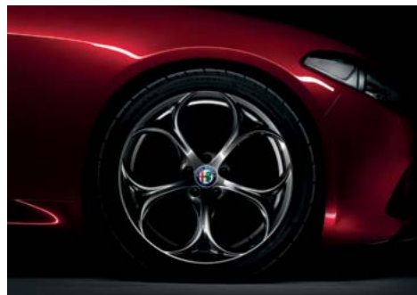
5EQ 19-Inch 5-Hole Dark Finish Alloy Wheel (Standard - Veloce / Linked to Veloce Pack)