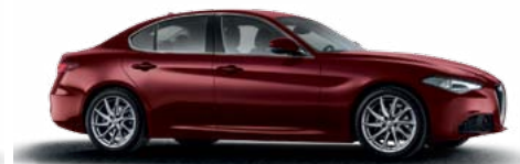
093 Monza Red Option