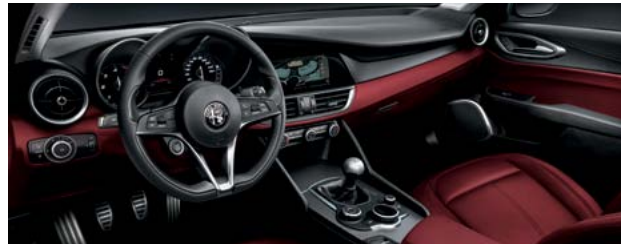
Red Leather with Red Trim