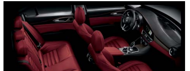
Red Leather-Trimmed Dashboard with Oak Detailing - Red Leather Upholstery