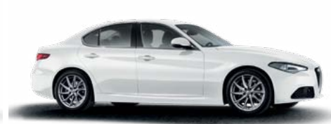
248 Trofeo White Option