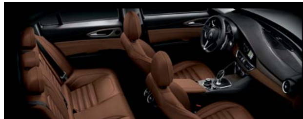
Tan Leather-Trimmed Dashboard with Oak Detailing - Tobacco Leather Upholstery