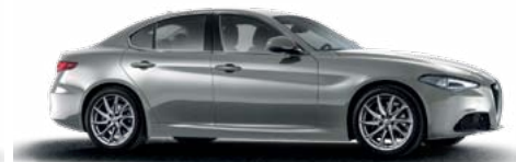
318 Stromboli Grey Option