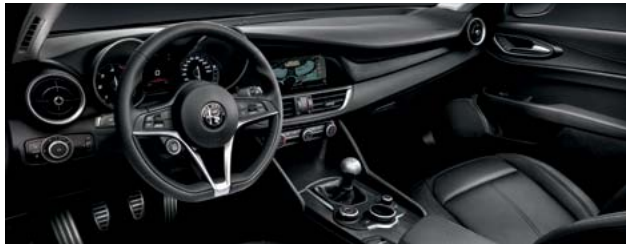
Black Leather with Black Trim