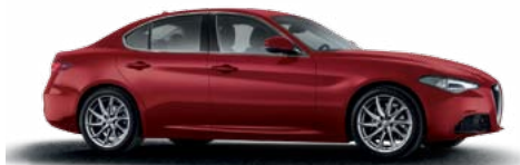
414 Alfa Red