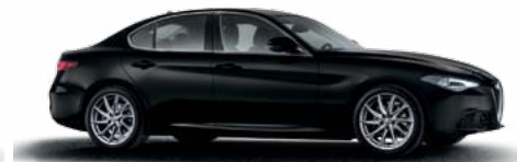
601 Alfa Black