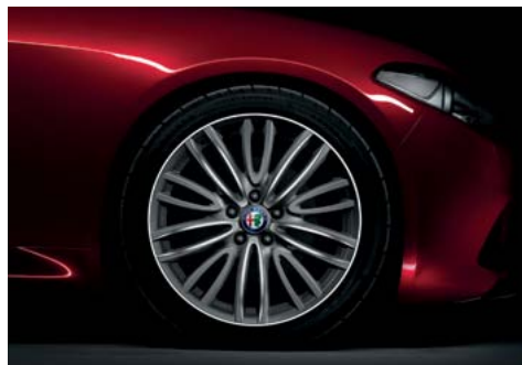
4AY 18-Inch Luxury Design Alloy Wheel (Standard - Super Petrol)