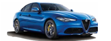
756 Misano Blue Option