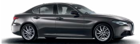
035 Vesuvio Grey Option