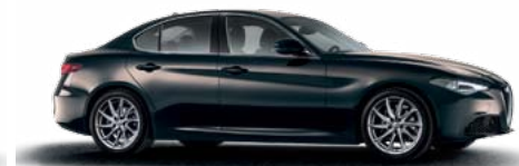
409 Lipari Grey Option