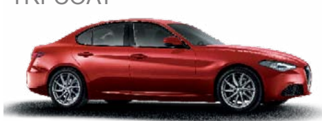
361 Competizione Red Option