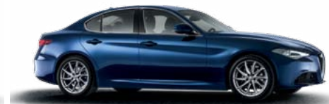
092 Montecarlo Blue Option