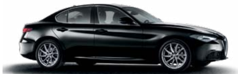
408 Vulcano Black Option