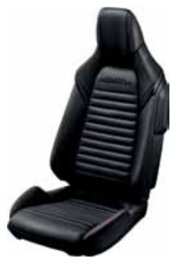
508 - Black Leather with Red Stitching (Option)