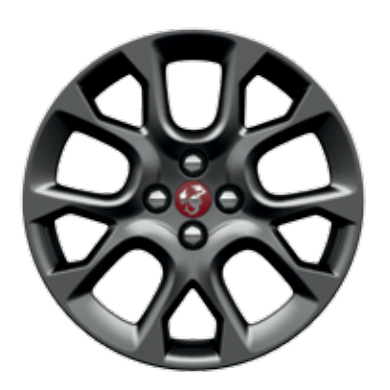
17-Inch Gun Metallic Wheels Standard