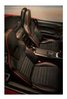
4HV - Black Leather & Alcantara Recaro Seats with Red Piping (Cost Option)