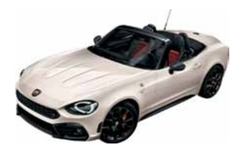
245 - Tri-Coat White (Tri-Coat) Cost Option