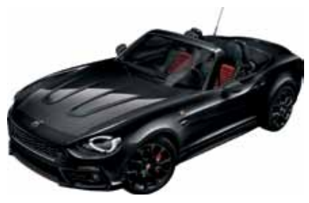
244 - San Marino 1972 Black (Metallic)