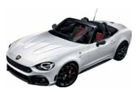
163 - Turini 1975 White (Solid)