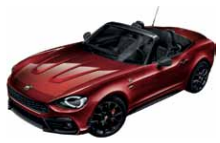
162 - Costa Brava 1972 Red (Solid)