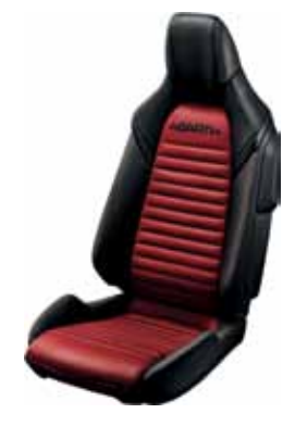
515 - Red/Black Leather with Red Stitching (Option, NAW: 208)