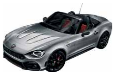
235 - Portogallo 1974 Grey (Metallic)