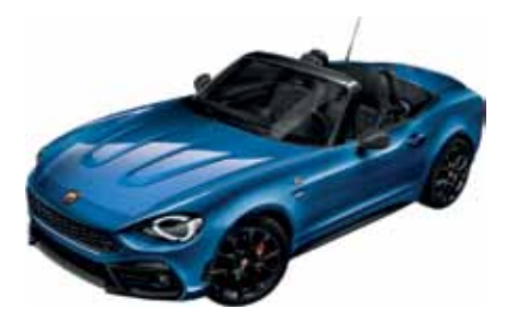
208 - Isola d-Elba 1974 Blue (Metallic)