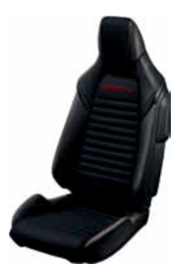
315 - Black Leather & Microfibre with Red Stitching (Option)